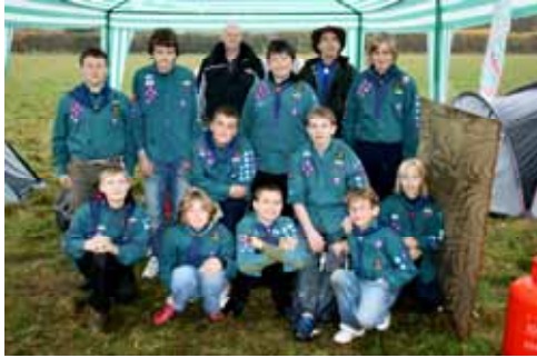
Hatfield Peverel Scout Troop

To all the people involved we give thanks for an opportunity to show all our children how they can gain awards and complete challenges by having fun, making new friends and learning new crafts.