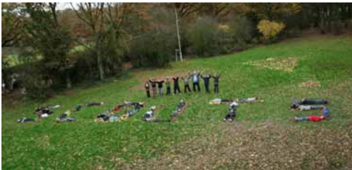
Compass bearing sign

To all the people involved we give thanks for an opportunity to show all our children how they can gain awards and complete challenges by having fun, making new friends and learning new crafts.