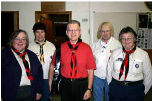
Part of the team

The district held a special event at Prances training ground on 14, 15, 16 November in which 38 young people from the Scout section, supported by 15 adults, came together to learn about