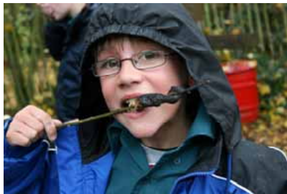
Backwoods cooking overdone !

also learnt how to work together as teams, cooking and camping, using the Patrol system.