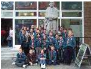
Outside BP House

Over the weekend of 27 th / 28 th October 31 Scouts (half the Troop) from Silver End and 2 Vortex Explorers spent a weekend in London. Travelling to the City on public transport they arrived at Victoria Coach Station before then travelling across London to Baden Powell House. They left their bags in the baggage room and had lunch before setting off to Madame Tussauds.