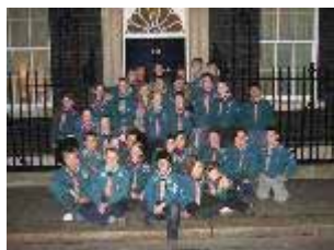
Outside No 10

After completing the tour it was then off to get some food at Piccadilly Circus. After refuelling there was a surprise in store for the Scouts. As they walked along the streets they were told to stop in front of gated off road. None of them realised where they were. They were then allowed in past the security guards and barricades to find themselves standing on the steps of Number 10 Downing Street. As well as time to take photos on the step they also chatted to the policeman outside who was more than happy to talk to them and let them try on his helmet.